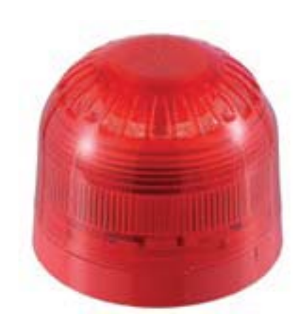
Applications - Fire; security; industrial alarm